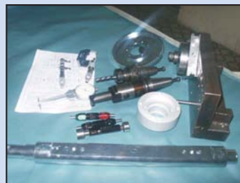
Manufacturing Process Is Diagnosed