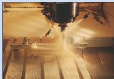
Manufacturing is Simplified