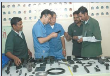
Parts To Be Manufactured